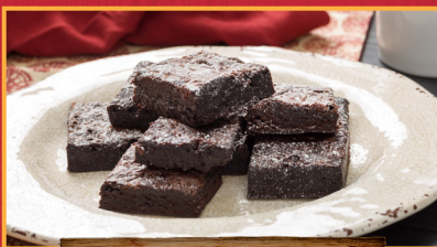
BROWNIE TRAY 40.00